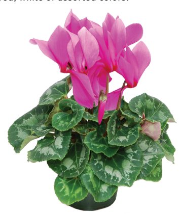
4.5" INTERMEDIATE 15 pots per case