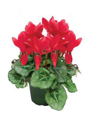
3" MINIATURE 18 pots per case

Available in 3" miniatures as well as 4.5" intermediate, and 6" large flowered varieties from October until Christmas. Available in red, white or assorted colors.