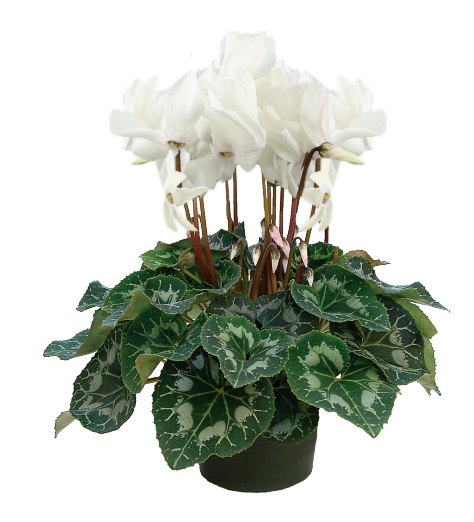
6" LARGE FLOWERED 8 pots per case