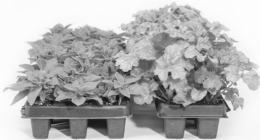
2-51 2 STRIPS WITH 50 IN EACH.

Our most popular sizes, with an extensive variety listing. These can be used in any size pot or basket with great success. They work well for mixed containers too, and with over 700 varieties to choose from, you'll have an outstanding selection. Tags included.