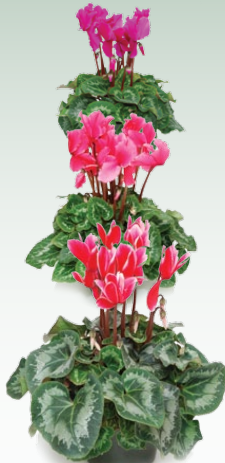
6" Fancy Flowered (8 pots/case)