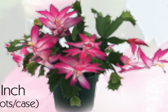
4 Inch (15 pots/case)

Try our Christmas Cactus...available in 4" and 6" pots. Order by the case. Our assortment of colors; available weeks of November 14, 21, and 28.