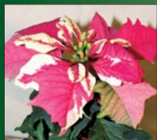
Strawberries n Cream