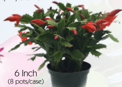
6 Inch (8 pots/case)