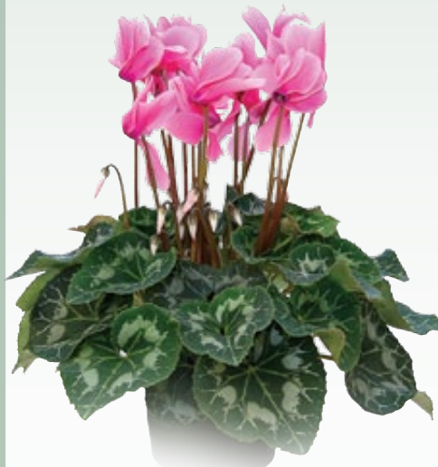
6" Large Flowered (8 pots/case)