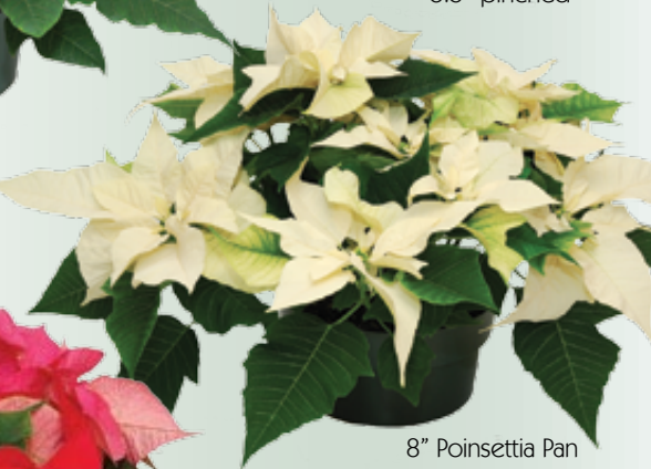
8" Poinsettia Pan

Our friendly staff is on hand to help in any way. Give us a call!