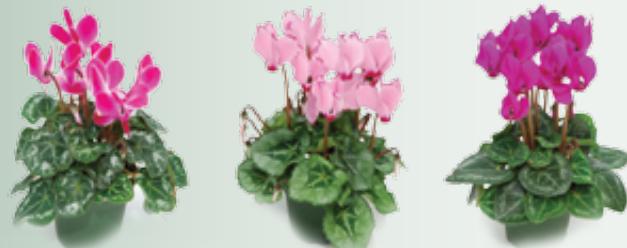
3" Miniature (18 pots/case)