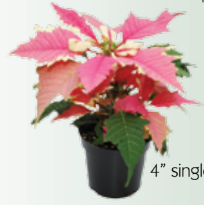
4" single stem