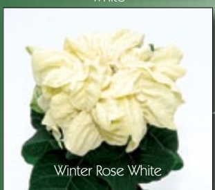
Winter Rose White