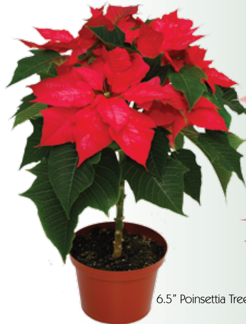
6.5" Poinsettia Tree

10" Poinsettias - If you need the biggest and best, this one is for you! The spread of these lovely plants can measure up to 30" across. Packed 2/case.