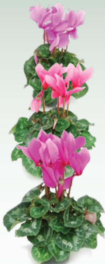
4" Intermediate (15 pots/case)